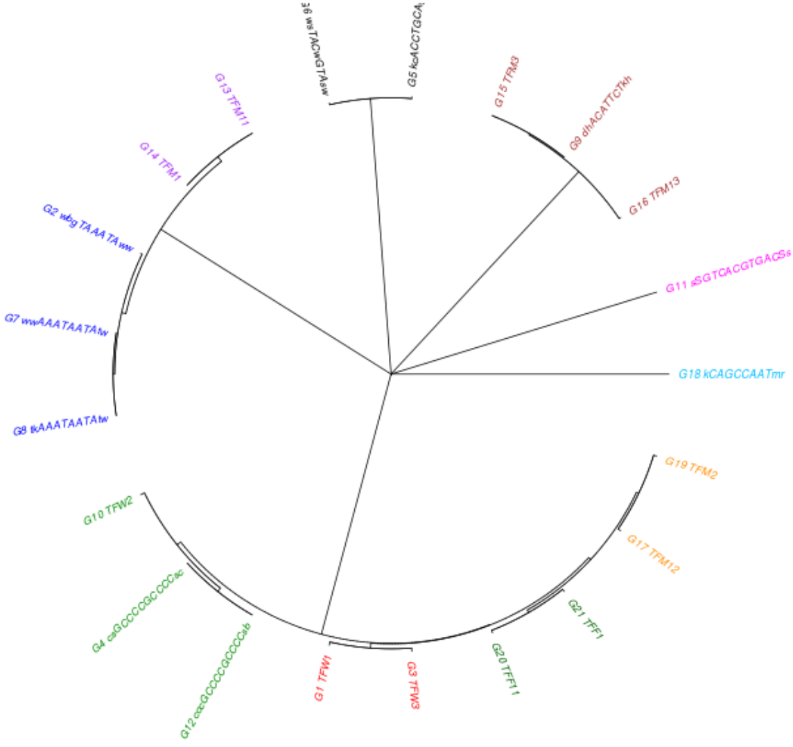
Motif Tree for Global Significant Motifs and Their Best Matches